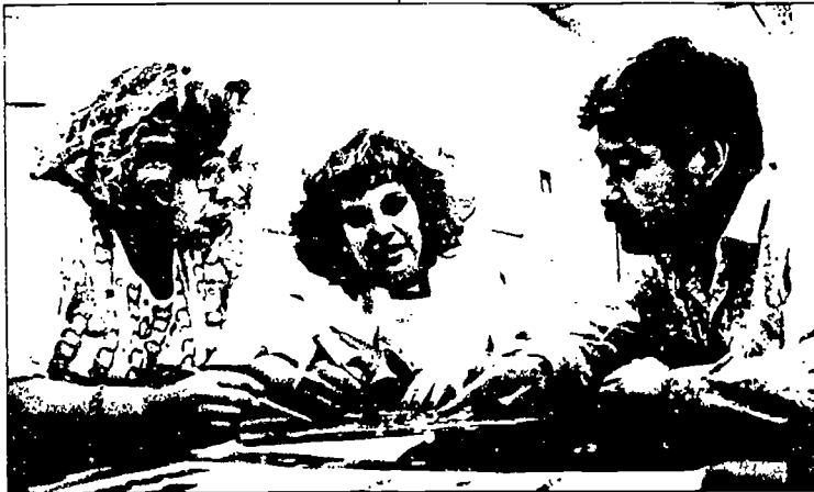
Teachers from El Paso and Juárez work together to share international understandings in education.

Building on the region's bicultural heritage and UTEP's strong relations with Mexico, the Teacher Learning Community Center also sought to build a learning community of teachers from both sides of the border. The center